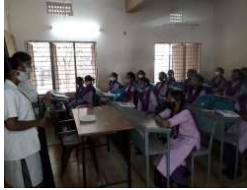
Awareness Programme on National Deworming Day