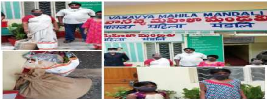
Distribution of Food