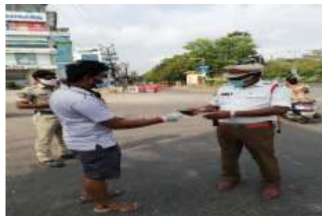
Distribution of Sanitizers