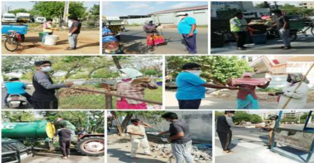
Distribution of Mask