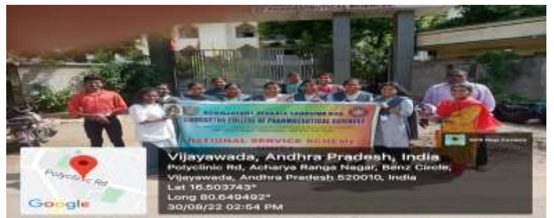
Awareness program on Eco-Friendly Ganesh Idols