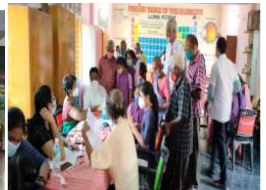
Mega Medical Camp