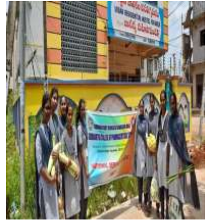
Vegetables Distribution for Orphanage