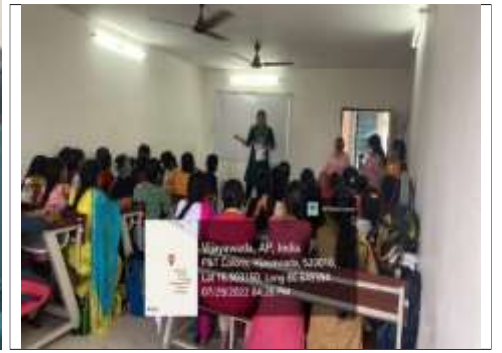
Awareness Programme on Menstrual Hygiene