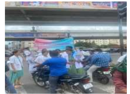
Outreach Programme on Air Pollution Awareness Programme