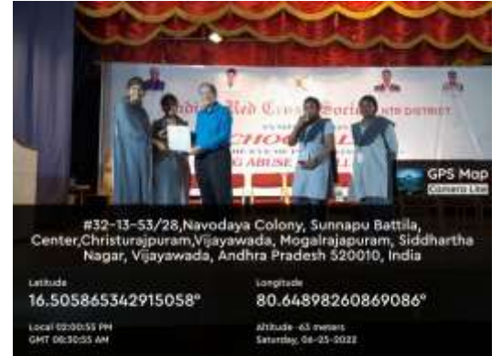
Awareness Programme on Drug Abuse & Illicit Trafficking