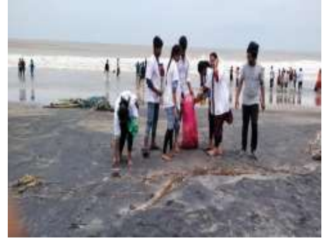
Awareness program on International Plastic Free Day