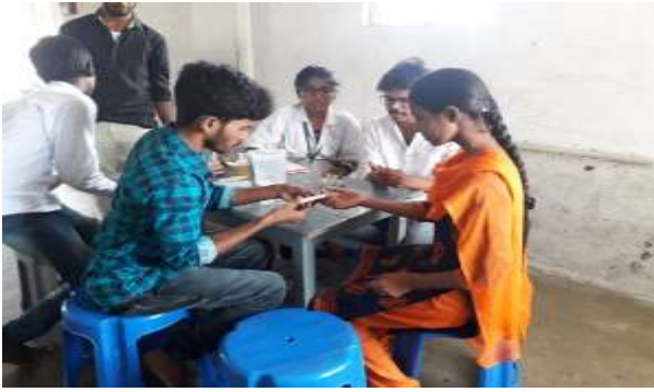
Blood grouping & Blood Donation Awareness Programme